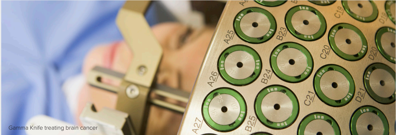
Gamma Knife treating brain cancer

This progress report serves as an update to the CNIC’s advocacy efforts through the Isotopes for Hope campaign to maintain momentum and continue working toward the goal of doubling production by 2030. Each recommendation is organized into one of three categories: